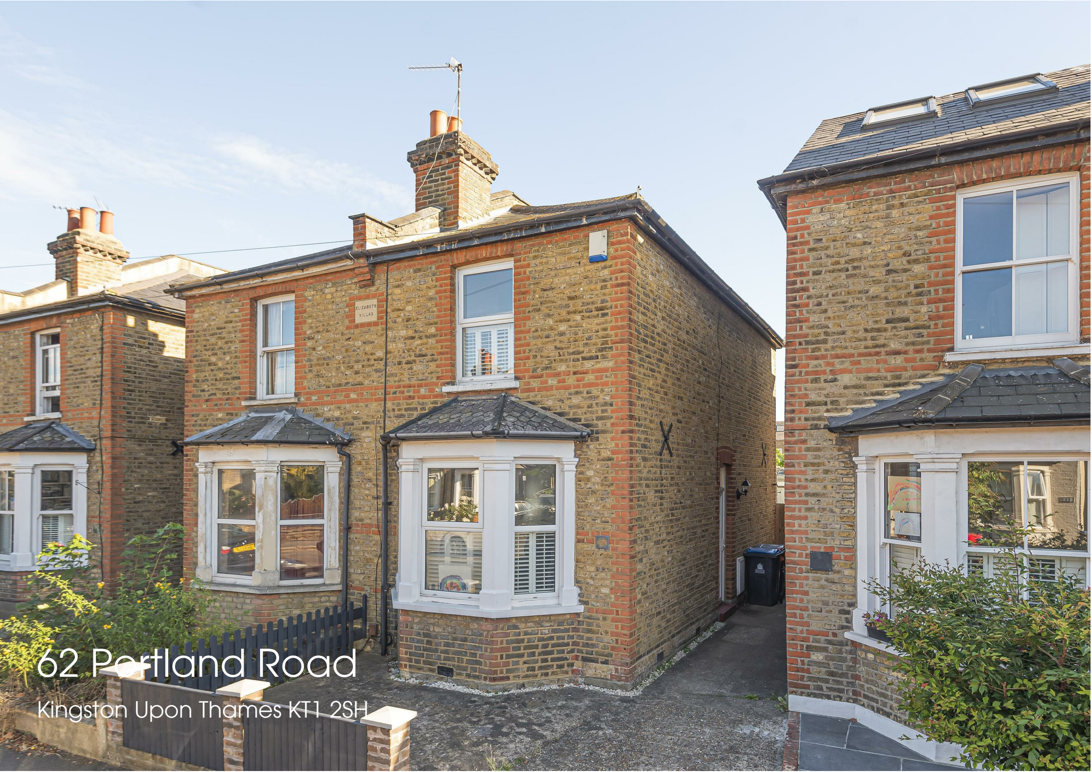
62 Portland Road Kingston Upon Thames KT1 2SH